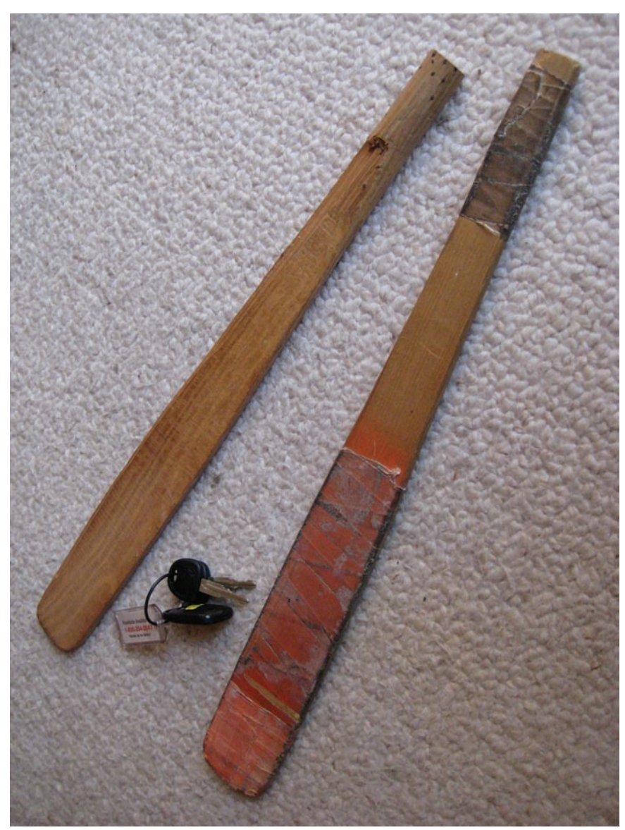
Paddles made from shaved down baseball bats; keys indicate size.

short one for girls and a long one for the boys."<sup>16</sup> One former teacher in Texas told Human Rights Watch that he found shaved down baseball bats that were being used as paddles, similar to those depicted in the following photograph.<sup>17</sup>